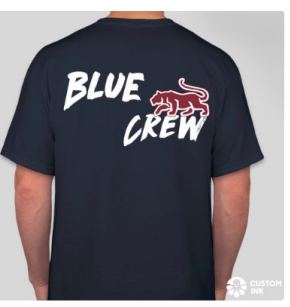
Shirts cost $12 and will be available for pick up on August 9th if ordered online.

Student Section Shirts will be sold at Freshman Orientation and at the Upperclassmen Open House