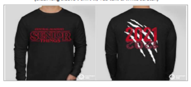
To place your order: Order by July 15th for Open House Pick Up

SENIOR CLASS T-SHIRT (black long sleeve t-shirt w/ red text & white scratch)